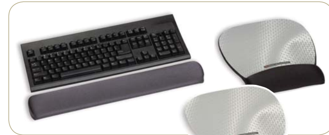
WR310GY Fabric Wrist Rest – Grey

3M™ Gel Wrist Rests for Keyboards and Mice are available in a variety of designs, colours and materials to suit your workspace and style.