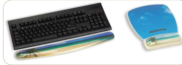
WR302BH Clear Gel Wrist Rest - Beach