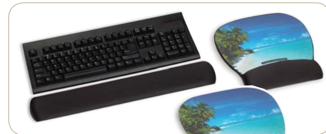
WR310MB Fabric Wrist Rest – Black