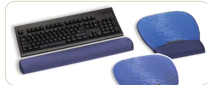
WR310BE Fabric Wrist Rest – Blue