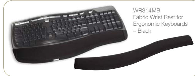
WR314MB Fabric Wrist Rest for Ergonomic Keyboards – Black